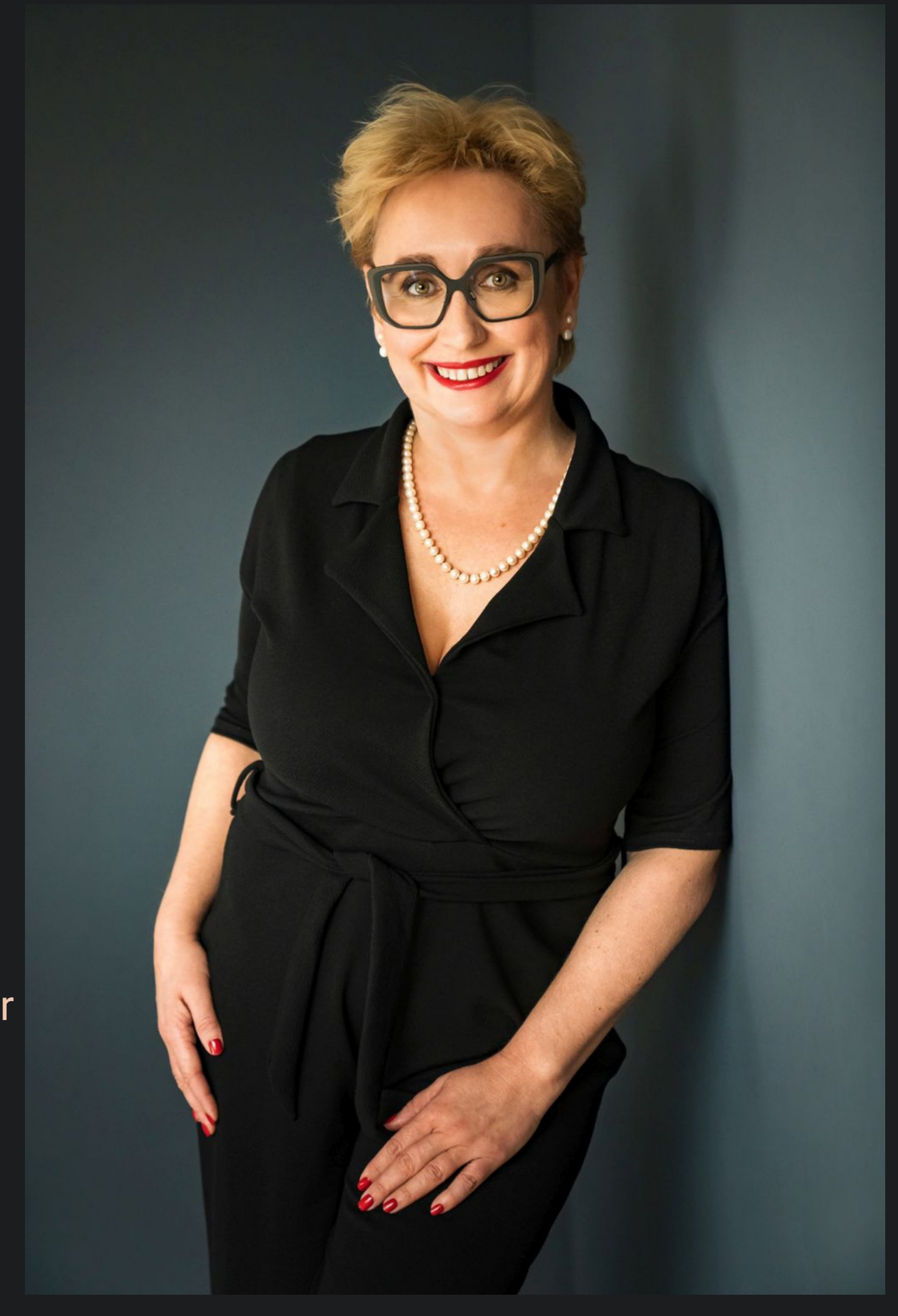
Leadership s dopadem